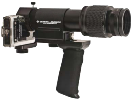
CoronaFinder with optional camera

CoronaFinder can be configured with an adapter to attach a variety of optional digital, CCD and digital video cameras to record and download images and video for review, annotation, reporting, and storage. CoronaFinder imagery can also be "zoom" viewed on the camera display.